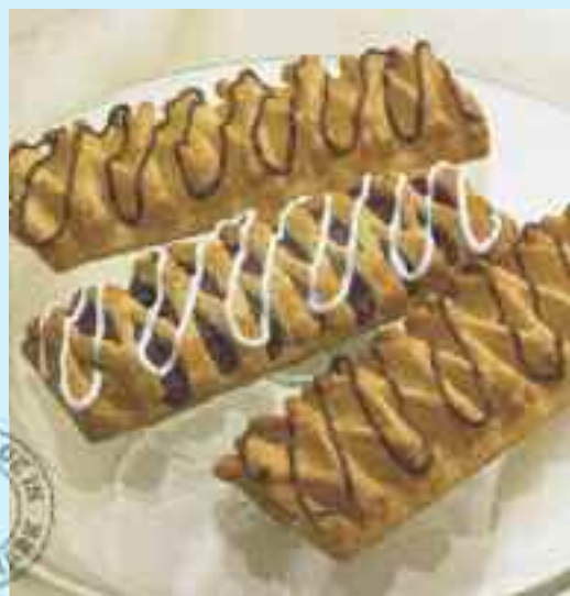
F67692 Danish Trellis Mixed Pack (Raspberry Trellis & Orange Trellis)

The new bars are available in two delicious flavours, orange and raspberry, in a mixed case of 2 x 24 including decorative sugar and chocolate flavoured icing. At the recommended selling price of £2 for a 4 pack, using our Rectangular Confectionery Hinge Pack, the retailer margin is