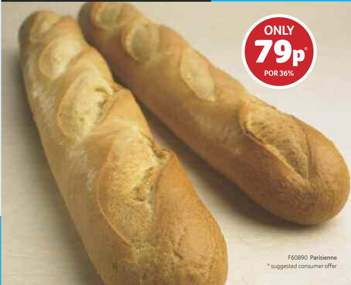
F60890 Parisienne * suggested consumer offer

Offers apply to deliveries between 17th - 30th July 2010 inclusive