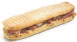
F31512 Ham & Mozzarella Melt Panini