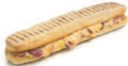
F33429 Cheddar, Mozzarella Cheese & Red Onion Panini