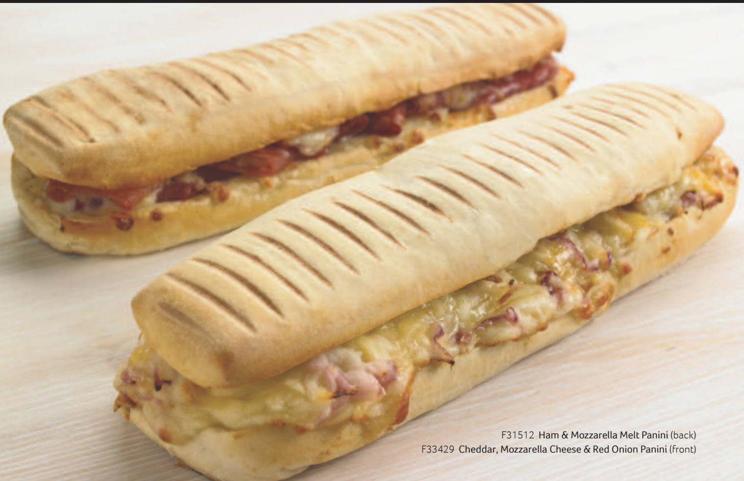
F31512 Ham & Mozzarella Melt Panini (back) F33429 Cheddar, Mozzarella Cheese & Red Onion Panini (front)