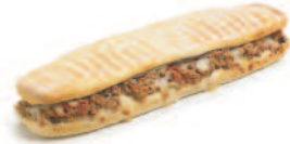
F31521 Tuna Melt Panini