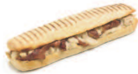
F31513 Chicken Bacon Mayo Panini