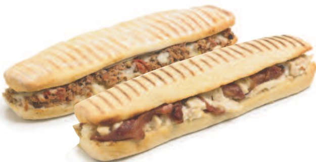
F31521 Tuna Melt Panini (back) F31513 Chicken Bacon Mayo Panini (front)

All varieties are fully prepared right down to the characteristic 'grill marks.' To reheat simply remove the panini from its film-wrapping, insert into the special cardboard crisper and microwave for 2 minutes – for full instructions see overleaf.