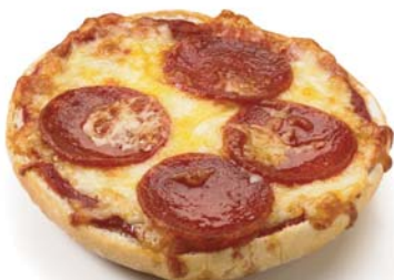
Mini Pepperoni Pizza