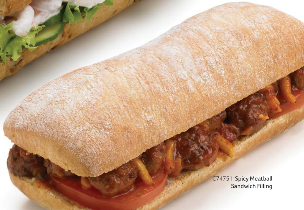
C74751 Spicy Meatball Sandwich Filling