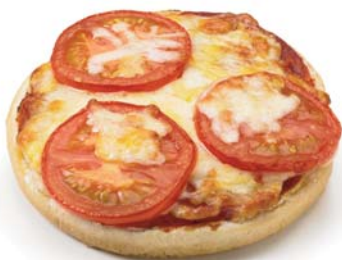
Mini Cheese & Tomato Pizza

Cooking instructions for Cheese and Pickle Twist: Always bake from frozen. Remove the required amount from the outer case and place on a clean lined, solid baking trays allowing 4 to 5cm of space around each product. Pre-heat oven to 190°C (fan assisted) and bake for 15 to 18 minutes. A core temperature of +82°C must be achieved before the product is removed from the oven. If displaying hot this product must be transferred immediately to a pre-heated display that will maintain a core temperature of +63°C or higher. Shelf life once baked: Hot - 4 hours.