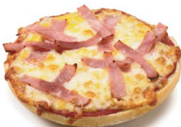
Mini Cheese & Ham Pizza