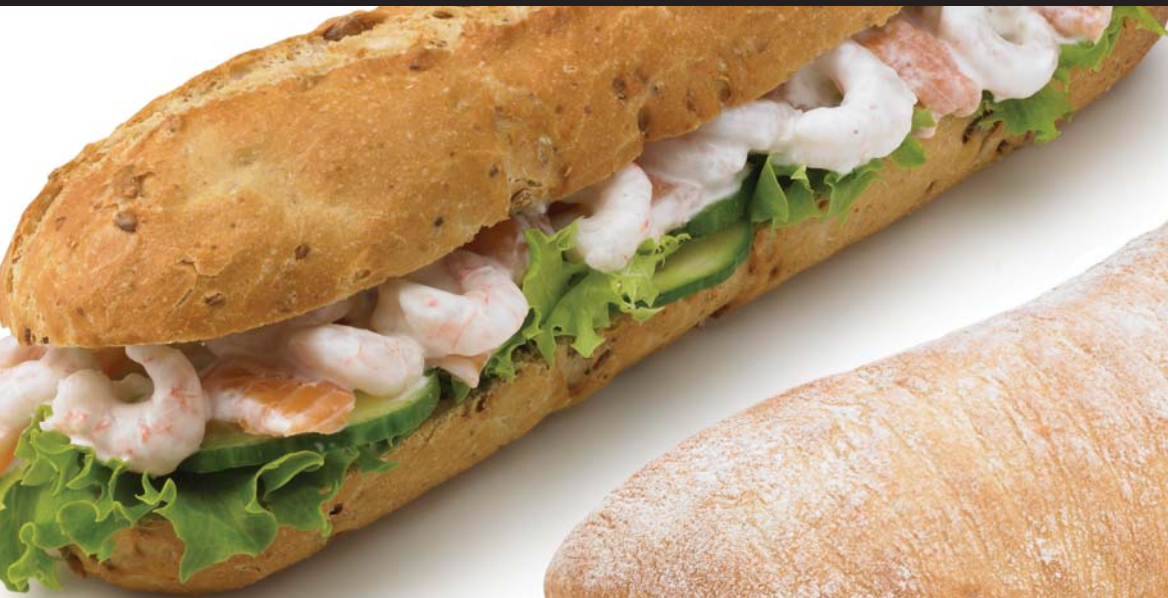
C74707 Salmon and Prawn Sandwich Filling

JULY 2009 • NEW RANGE OF SAVOURY SNACKS AND SANDWICH FILLINGS