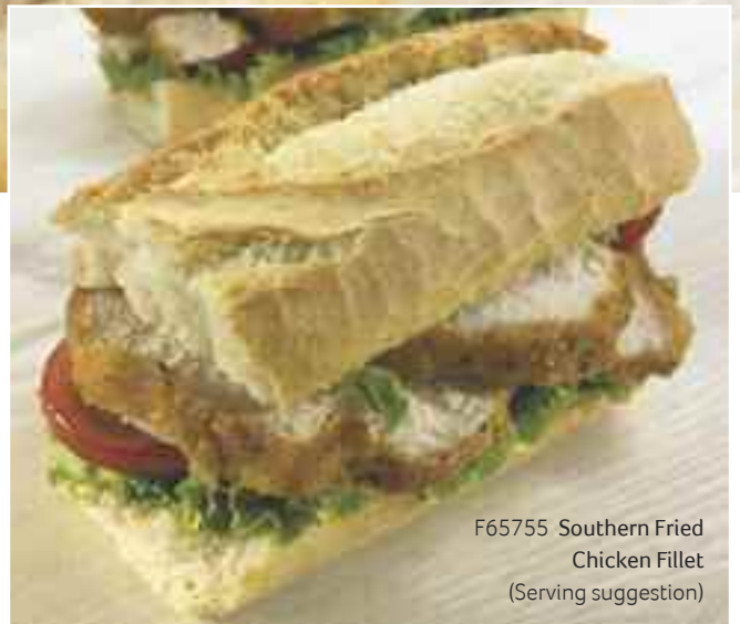
F65755 Southern Fried Chicken Fillet (Serving suggestion)

Made from 100% whole chicken breast with a crispy breadcrumb coating these two delicious fillets set a new standard in taste and quality. With recipe applications such as Burgers, Filled Baguettes, Subs, Wraps and even Salads ‘versatility’ really is at the heart of these two new products.