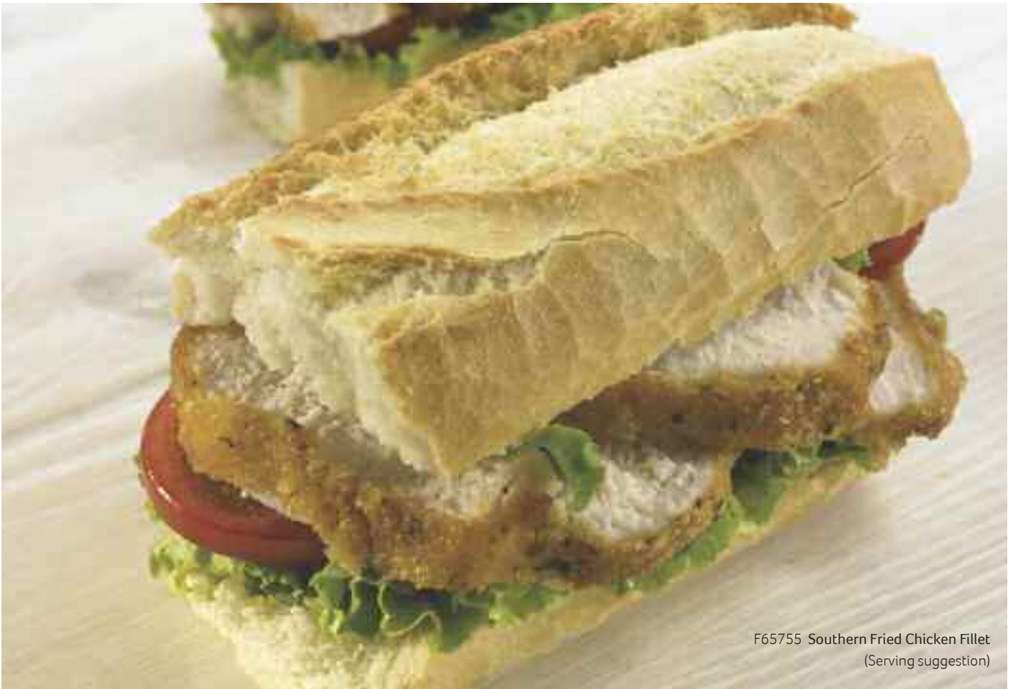
F65755 Southern Fried Chicken Fillet (Serving suggestion)