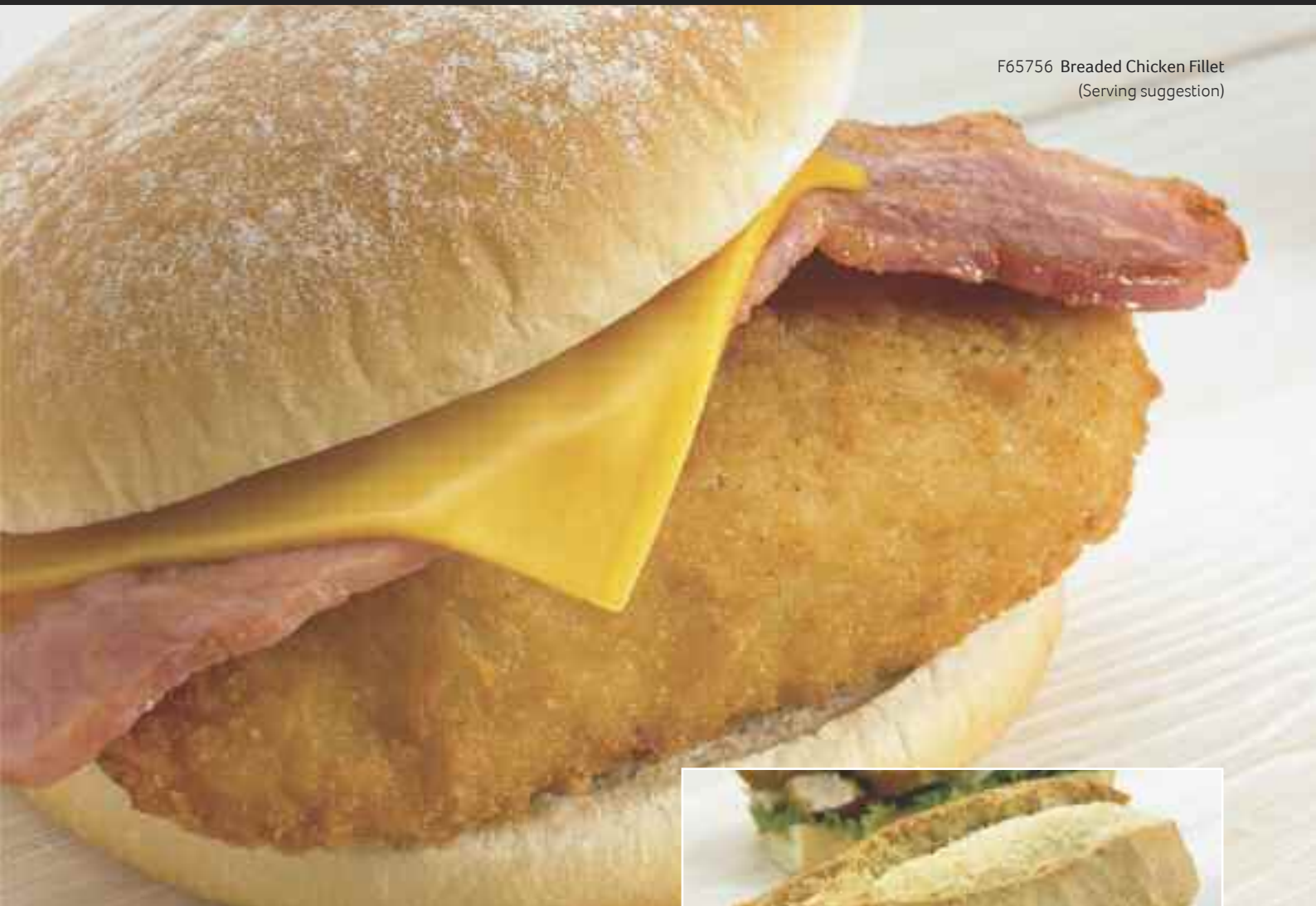
F65756 Breaded Chicken Fillet (Serving suggestion)

APRIL 2010 • BREADED & SOUTHERN FRIED CHICKEN FILLET