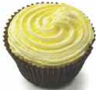
64080 NEW Lemon Drop Cupcake