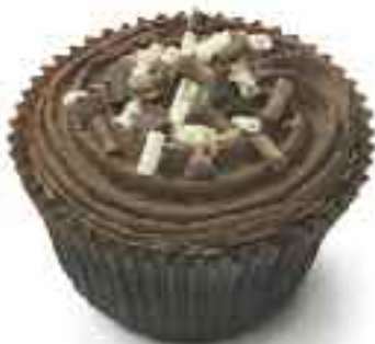
64082 NEW Chocolate Dream Cupcake