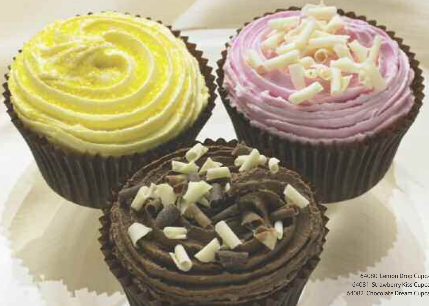
64080 Lemon Drop Cupcake 64081 Strawberry Kiss Cupcake 64082 Chocolate Dream Cupcake