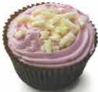
64081 NEW Strawberry Kiss Cupcake